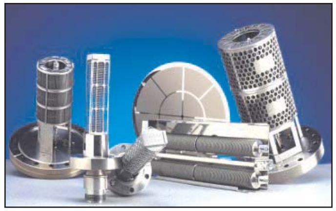
Another method of boosting the effective pumping speed is with an evaporable or non-evaporable getter (NEG). (Note: SAES is a primary supplier of getters worldwide and has produced, some wonderfully informative literature. See: <u>www.saesgetters.com</u>)